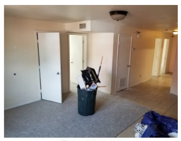
Typical living room