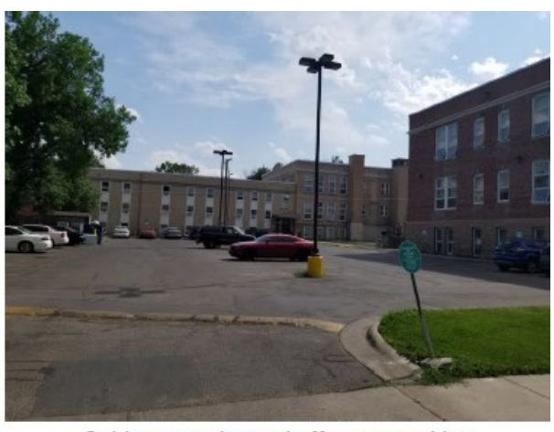
Subject exterior and off-street parking