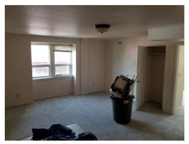
Typical living room