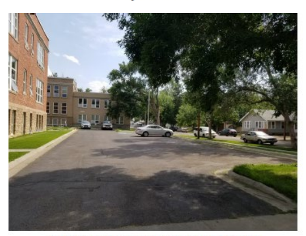
Subject exterior and off-street parking