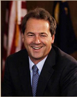
Governor Steve Bullock