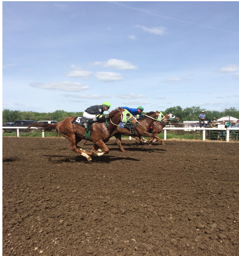
Horses racing to the finish in Miles City – 2018.

Eight days have been allocated for the 2019 season. In 2018, rain caused major problems for the race meet in Miles City and fingers are crossed that 2019 brings some improvements to the weather. Great Falls originally asked for 5 days, but have since decided to back the meet to 5 days and only run two weekends. Three days are scheduled for Miles City: May 12, 18, and 19 in 2019. Five days are planned for Great Falls: July 20, 21, 26, 27, and 28. Distribution to the tracks for purses and operations in 2019 will be $50,000 to Miles City and $100,000 to Great Falls. The distribution total for 2019 is $150,000, which is a 3% increase in the distribution to the tracks in 2018.